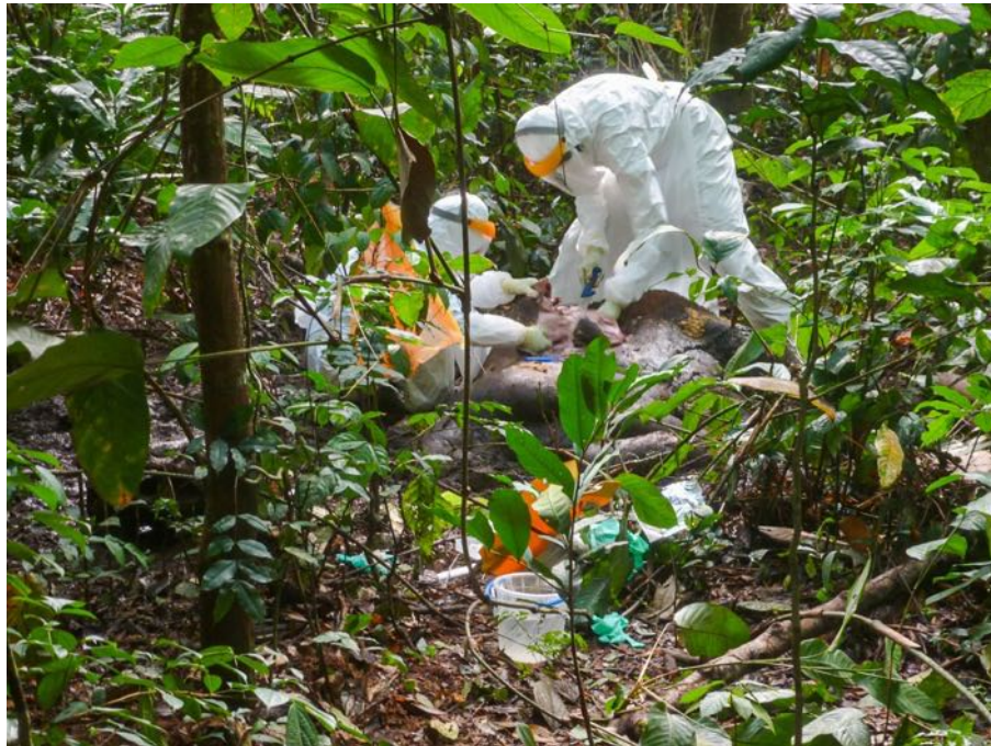
Collecting samples with all the security measures

Two carcasses, a baby elephant and a bongo were found in the forest by the gorilla tracking team, dead from natural causes. Samples were collected by the veterinary team for laboratory analyses.