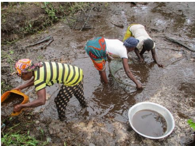
The new fish farm activity

We also supported a fish farming project. We have stocked almost 2000 fry in 18 ponds, covering an overall area of approximately 5.635 m 2 in Monassao, Nguengueli, Babongo and Mossapoula villages. A social agreement will be signed with the beneficiaries in order to perpetuate action of supplying local markets with fish, as a substitute for bushmeat.