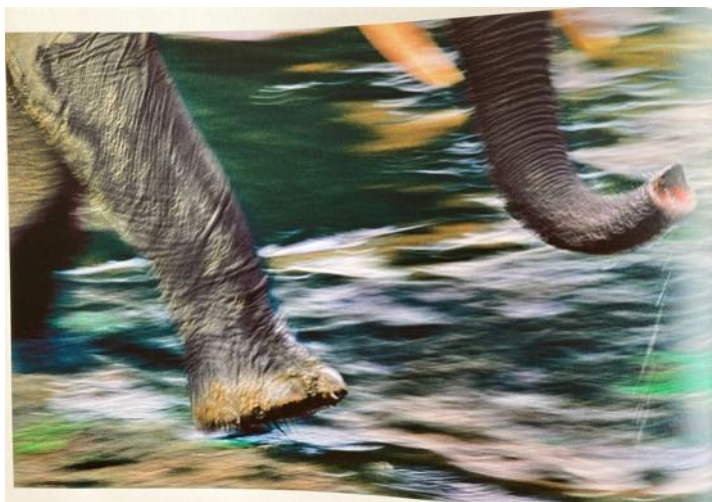
A signed copy of the book WILD by photographer Michael Nichols.