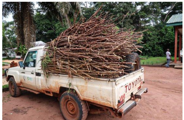
More than 20.000 manioc stems were distributed