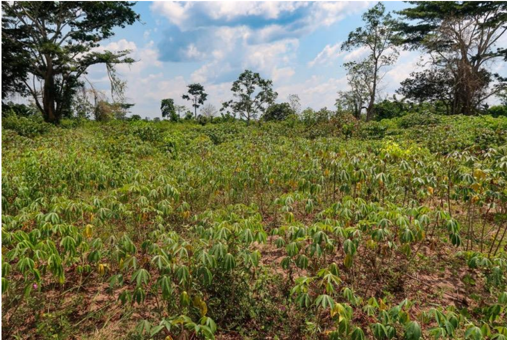
Manioc crops in the future DSPA Arena

This month we relaunched the works but faced the challenge that the land had been transformed into manioc farms by its former owners. After consultations between the council and these former land owners the problem was resolved and construction works could continue