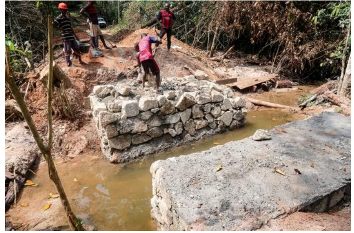
and the future new one

Both the director and the deputy director of the Park have attended the 26 th meeting of the FTNS Board in Douala (Cameroon), during which the budget presented was approved. In response to the lack of tourism (resulting from COVID 19 restrictions and therefore the closure of the park) which usually plays an important role in Park management and community commitments, the FTNS has slightly increased its contribution to help us partially alleviate this fact.