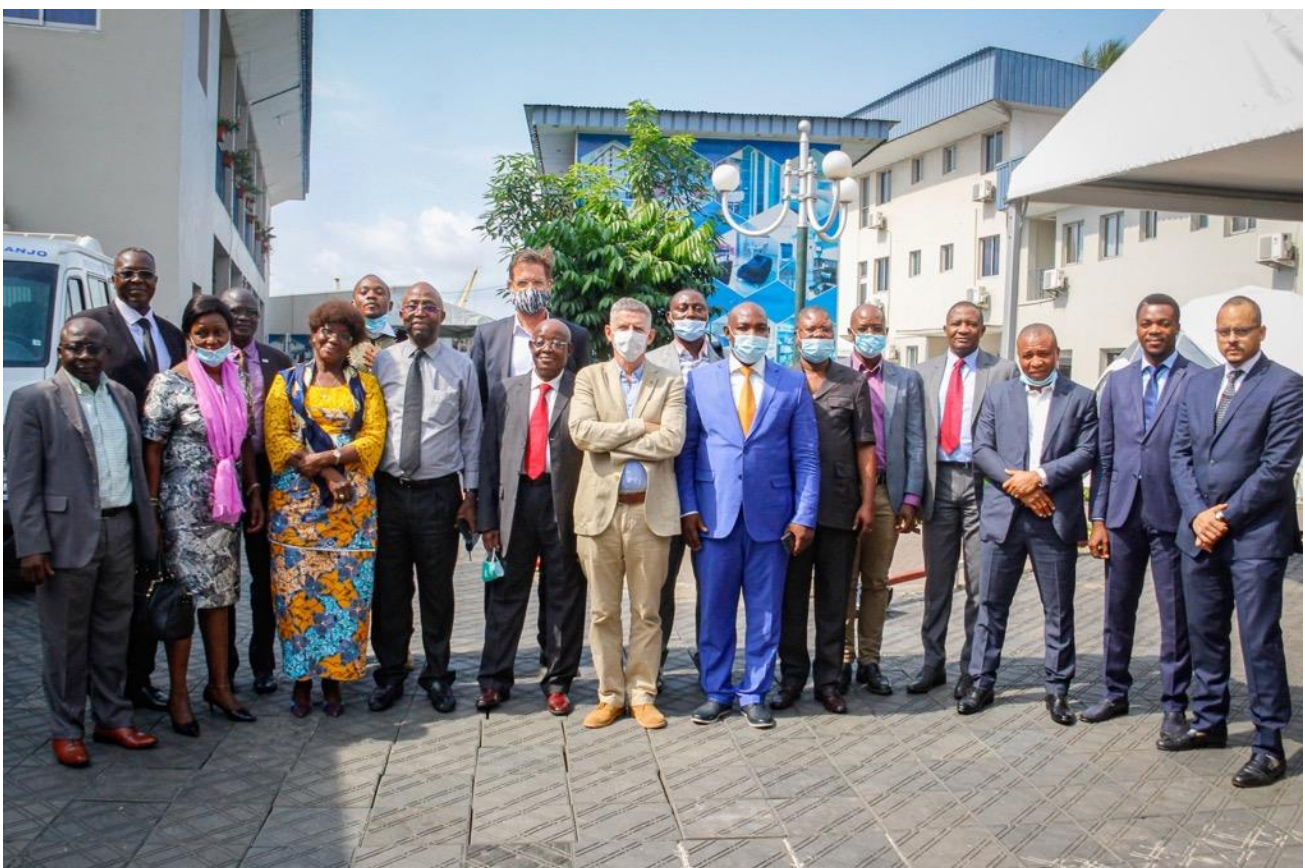
Participants to the FTNS board meeting in Douala

Apart from this, the KFW granted us new funds to promote and scale up ongoing one health activities in DSPA. Part of the funds will be used for the construction of a new laboratory.