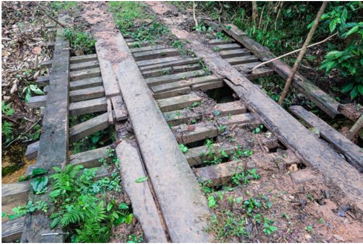
The old bridge....

The wooden bridge on the road leading to Dzanga bai already degrading for a while now became impassable and we decided to construct a new one with cement and iron rails to ensure durability and long-term use.