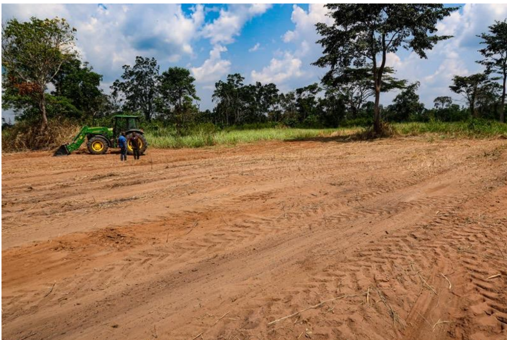
At last, we have been able to start the construction of the football field