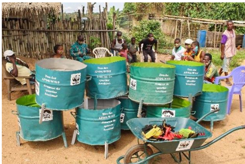
The sanitation remains a big problem in the region

To contribute to the sanitation of Bayanga we continue distributing equipment. This month we donated garbage bins, shovels, rakes and wheelbarrows to the Assabissé district