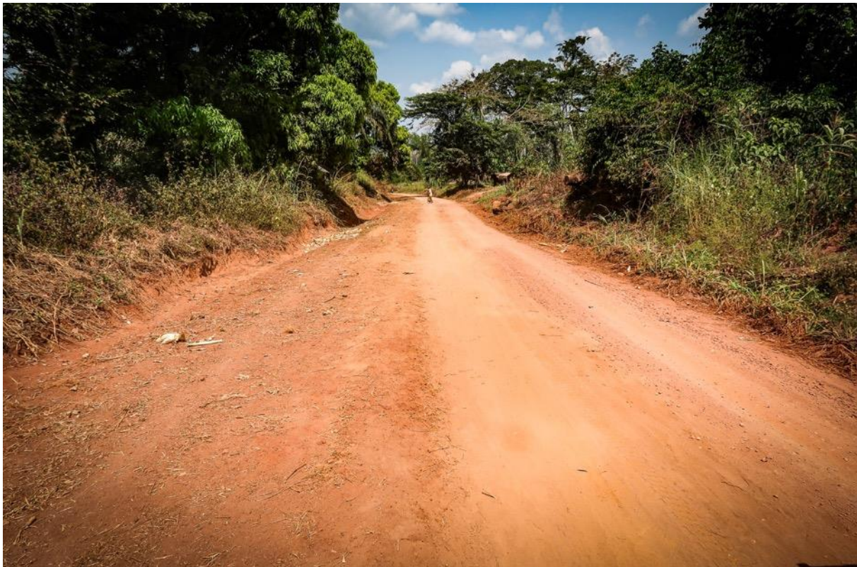
The new Sangha-Mbaere Highway