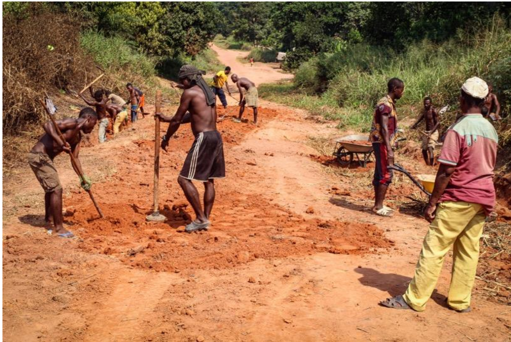
Repairing the road

After the rainy season that has just ended, the main road to Bangui was in very bad state making access to Bayanga very difficult. After several meetings with the representatives of the different villages along that road, we reached an agreement to join resources to repair the roads. It was agreed that the villages provide the labor while we provide the material/ equipment for road works as well as community meals for the teams.