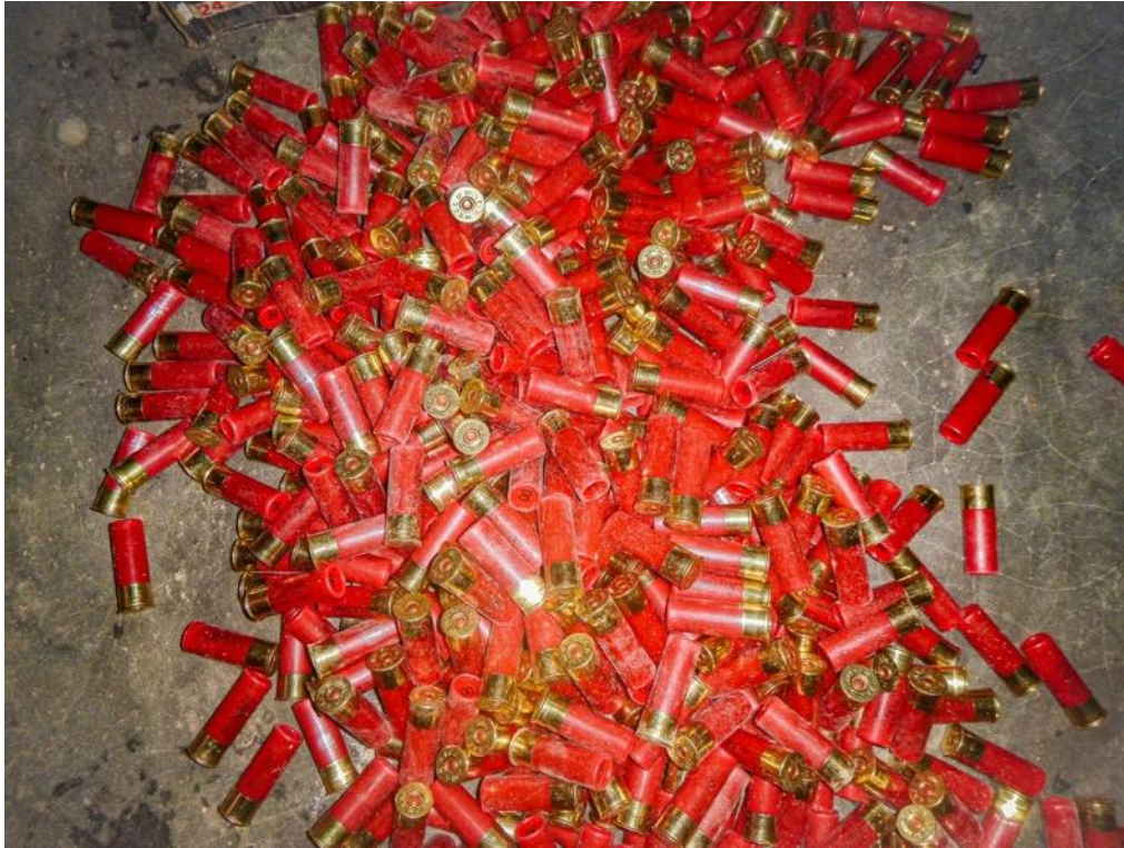
Almost 1.000 illegal cartridges were confiscated this month

Thanks to information received, the guards arrested an individual who arrived from Congo with almost a thousand munitions to sell within DSPA.