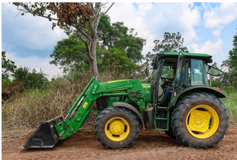
Since now everything will be easier © Luis Arranz

At last the tractor accessories (trailer, loader and grader) have arrived DSPA and we can now begin to repair the roads in the Park