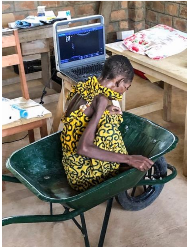
Sometimes is hard to be a doctor here