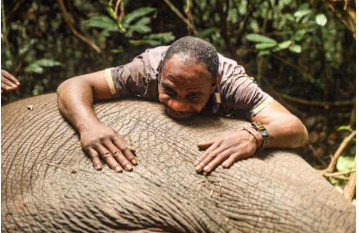
Elephants and BaAka, the soul of Dzanga Sangha