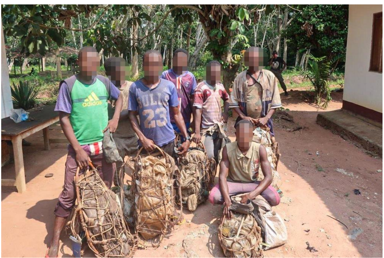
Hunting illegally in the DSPA

he last group of rangers underwent the "Anti-poaching Level 2" training at the Kongana training center. In the course a patrol exercise organized during the training, this group arrested 7 suspected poachers setting metal snares inside the Park. We found out that these same suspected poachers had already been arrested for the same offense in the Nouabale Ndoki National Park in Congo where their game was confiscated, and they were sensitized and released. Upon returning to CAR, they entered the Dzanga Ndoki National Park to set more snares.