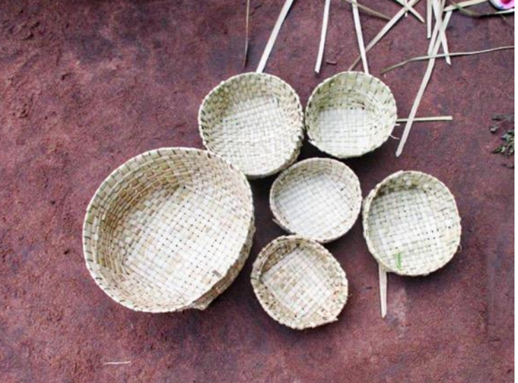
No too bad

In an effort to revive the Union of Ba'Aka Communities (UCB) which has been dormant for quite some time, we carried out consultations in 11 communities of Indigenous People within DSPA and its surroundings, and mobilized 273 representatives. The UCB will be very instrumental in ensuring the active participation of Ba'Aka in the management of DSPA