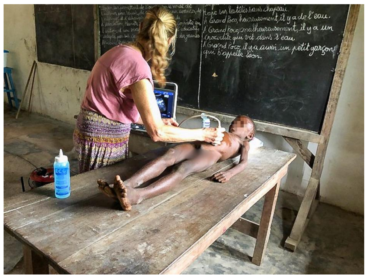
Doctors at work

The two German specialist doctors who came in to support the 'access to medical care' program continued to attend to patients in the villages within DSPA and its periphery this month. By the end of their stay they attended to over 700 patients.