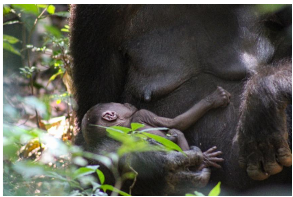
Mossika, four days old

The gorilla infant born into the Mata group at Bai Hokou last month is growing well and has been named "Mossika" by the trackers which in Ba'Aka language means "far away" referring to the fact that it was born while the group is residing far from its home range. Mossika is an offspring of the female Wusa and was born almost 5 years after its older sibling Payo.