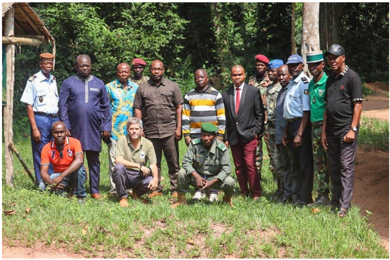
Judicial authorities attending the workshop

Last year the CAR Government approved a new Wildlife Code. This month we organized a workshop in Bayanga to present and explain the new regulations to local and judicial authorities.