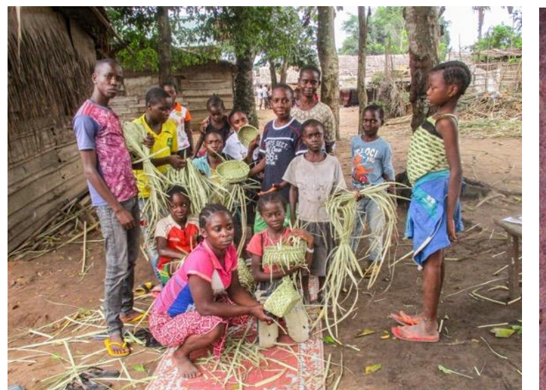
Young Baaka learning to make baskets

The Ndima-Kali youth association organized 2 workshops on traditional knowledge focused mainly on the braiding of baskets for fishing and emptying ponds and the manufacture of hunting nets for subsistence hunting. A total of 42 youths (30% girls) took part in these activities and the knowledge was passed on by 14 experienced elders.