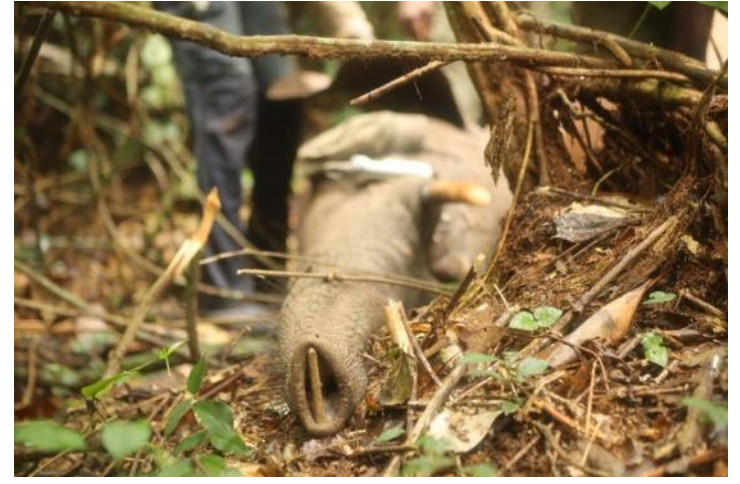
Craft respirator for elephants, simple but effective