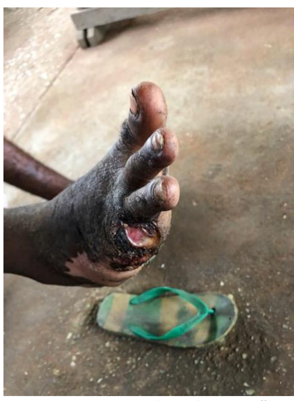
Really hard