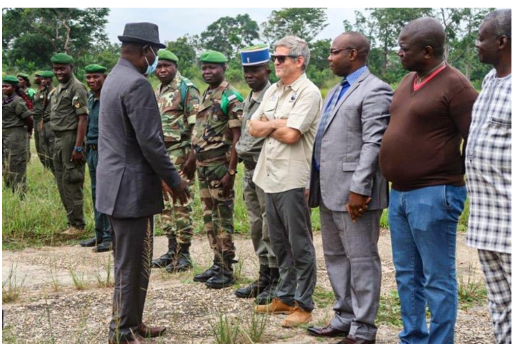
The Minister arriving to DSPA

His Excellency the Minister of Water and Forest paid a visit to DSPA. The visit which was originally planned for 4 days, finally lasted 7 days because the chartered plane could not fly as a result of poor weather conditions. Given that the last time he visited was before the Covid-19 pandemic, this visit was an opportunity to discuss many issues and find solution to problems. It was also the opportunity for the Minister to officially deliver the new statute of the ecoguards that had been approved by the Ministry.