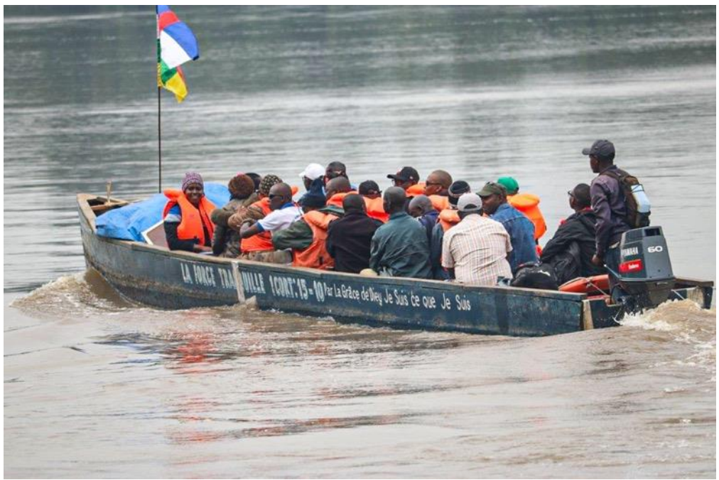
And the local authorities leaving for Ouesso

A delegation from the Sangha Mbaere took part in the meeting of the Tri-National Monitoring Committee (CTS), held in Ouesso, RoC. The CTS is one of the governance structures of the TNS that brings together the "Prefets" from the tree countries and the sessions deal with issues relating to free movement of persons within TNS, communication between the administrations of the different countries and any conflicts that have arisen between TNS stakeholders.