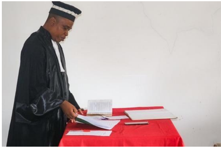
The President of the Court

This was followed by a court hearing where 5 poachers were tried and convicted of major offenses