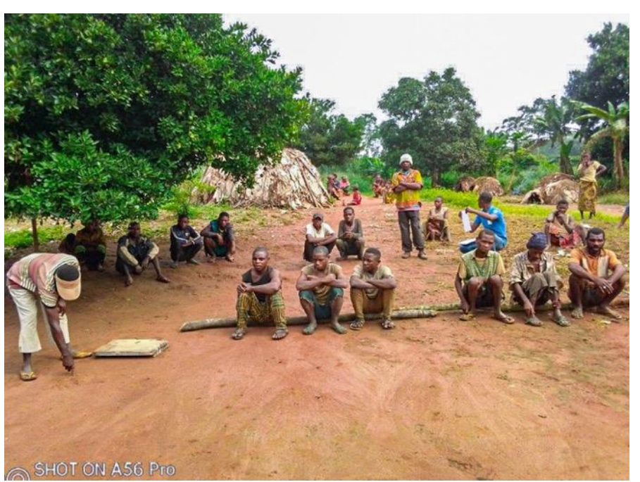
Meeting at the Moussapola Conference Hall

In an effort to revive the Union of Ba'Aka Communities (UCB) which has been dormant for quite some time, we carried out consultations in 11 communities of Indigenous People within DSPA and its surroundings, and mobilized 273 representatives. The UCB will be very instrumental in ensuring the active participation of Ba'Aka in the management of DSPA