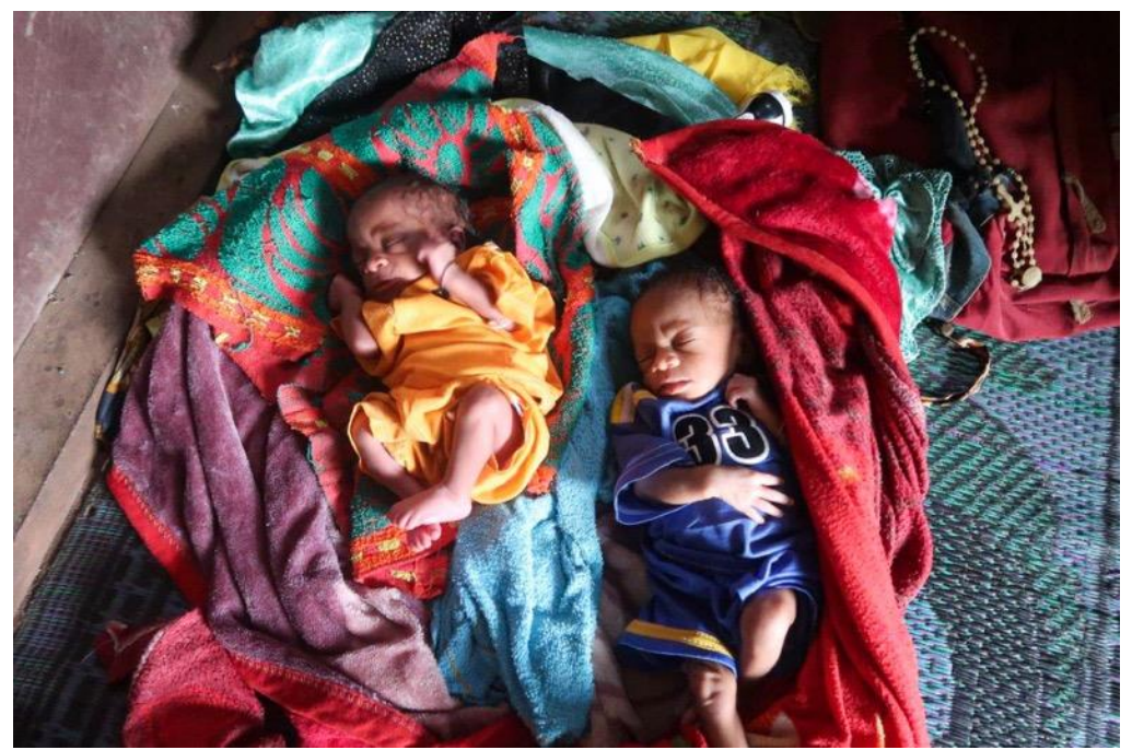
But others, it compensates. A couple of twins were born prematurely but are healthy thanks to the health team