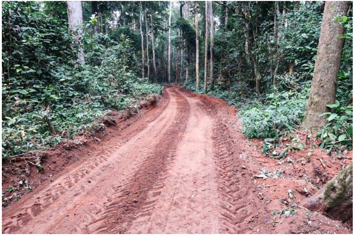
The final part of the road to Bai Hokou presented us some problems....

The last stretch of the road to Bai Hokou field site has been repaired and now driving the 30km to the site requires just 40 minutes instead of almost 2hours as before. Both passengers and cars will appreciate it.