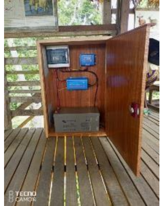
From now on the researchers will be able to charge their equipment in the bai