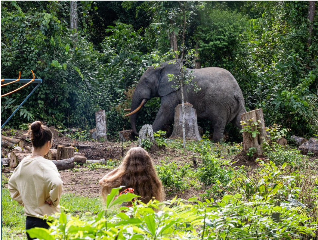
Elephants visit us regularly

Like every raining season, the elephants, normally big bulls, come close to our headquarters.