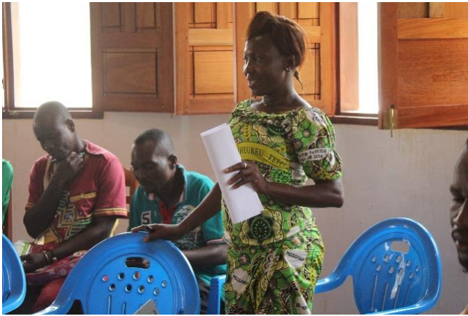
An action leader in action

The APDS relaunched the strategy of strengthening the Permanent Support Program for Indigenous Peoples with the resumption of the Action Leaders Project. The APDS in collaboration with the communities work with 33 action leaders, who are members chosen by the communities to play the role of intermediary (Community Relays) between the APDS and the communities.