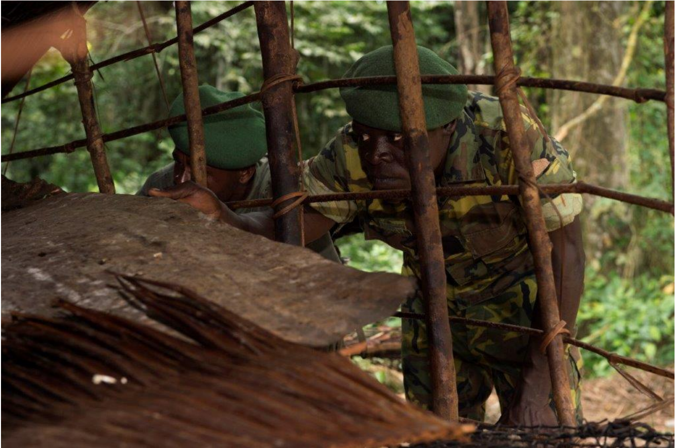
Rangers during a patrol in a poachers camp

This month we caught again four elephant poachers in the border between DSPA (CAR) and Nouabale Ndoki NP (RoC) they were Central Africans and were judged in Bayanga. Two of them were convicted to 3 years in prison and two were convicted to 10 years in prison.