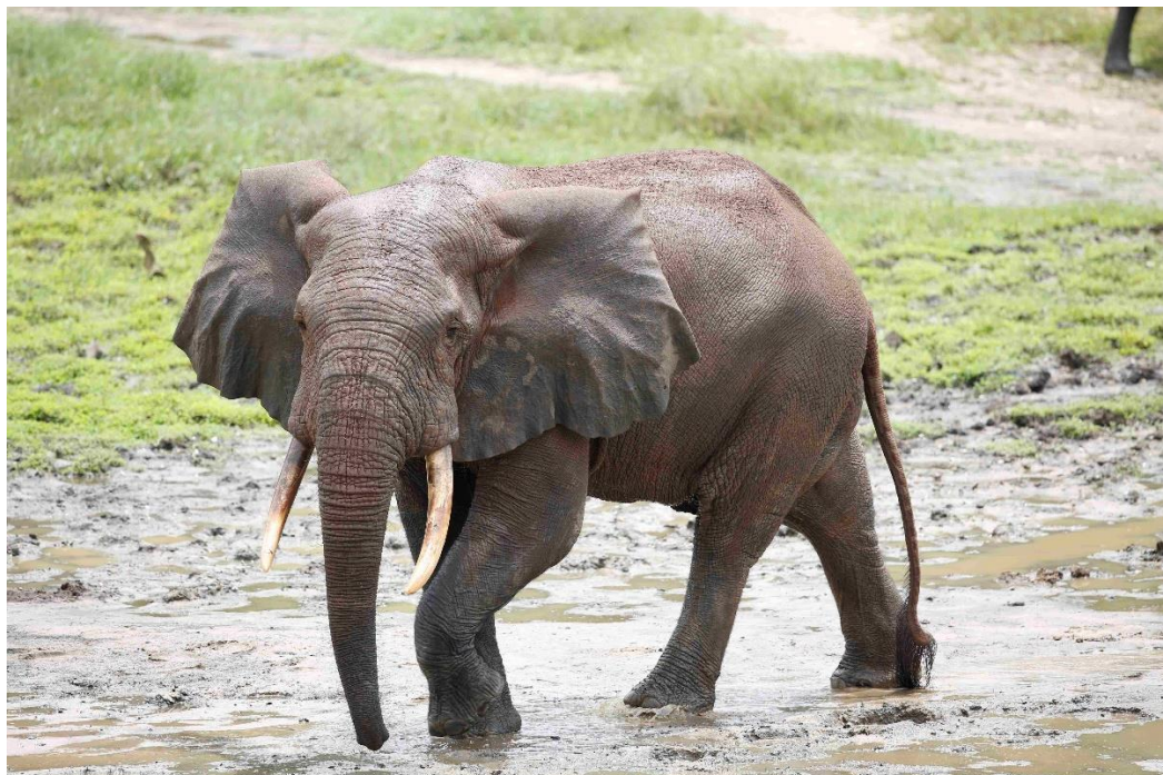
Conrad in December 2023 with an intact left ear.