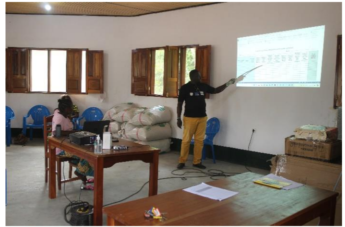
Learning how to fill out a datasheet

Since 2020, the APDS has supported two Ba'Aka, a young woman and a young man, enrolled in the Faculty of Political and Legal Sciences of the University of Bangui. Both of them have successfully finished their bachelor studies and will continue studying pursuing a Masters degree.