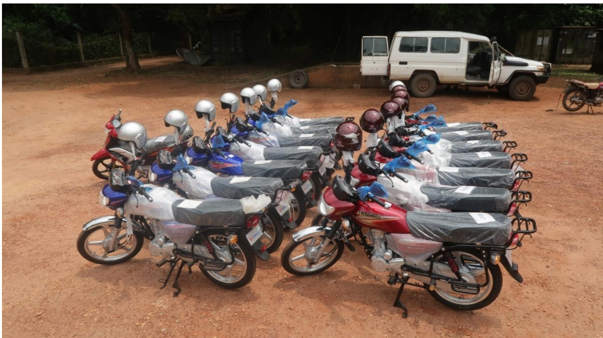
New motorbikes for DS

We have received 15 new motor-bikes for the park activities.