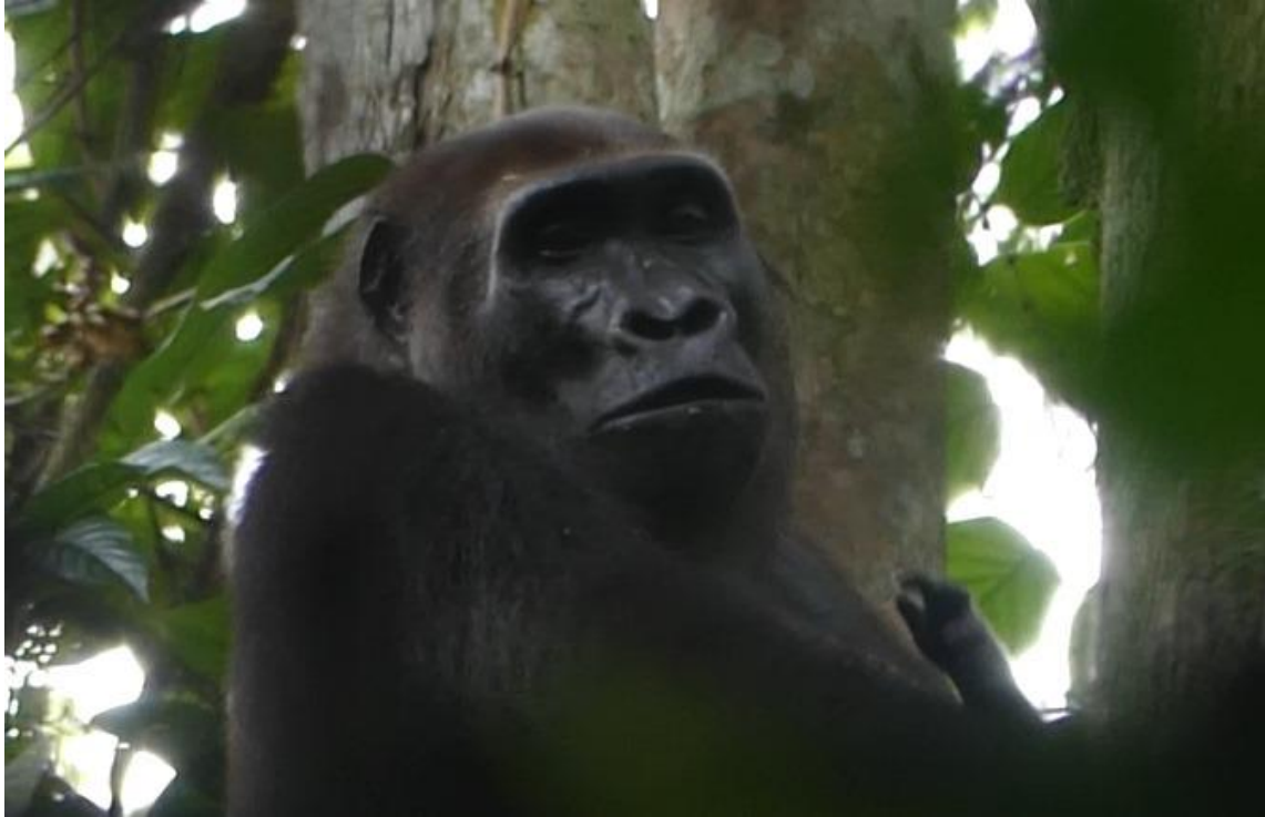
Mopatapata

Despite having lost the gorilla groups for a few days due to the heavy rainfalls of the season, our teams followed Limo and his family continuously. Contacts were made very early in the morning, close to the places where the gorillas spent the night, and close to where the group had been last observed the previous day. This behavior indicates that the gorillas are fleeing from our presence much less. One of the females of the group was identified as Mopatapata, a female who was with the Makumba group from 2000 to 2006. She is one of the four females of the new group who has a young baby.