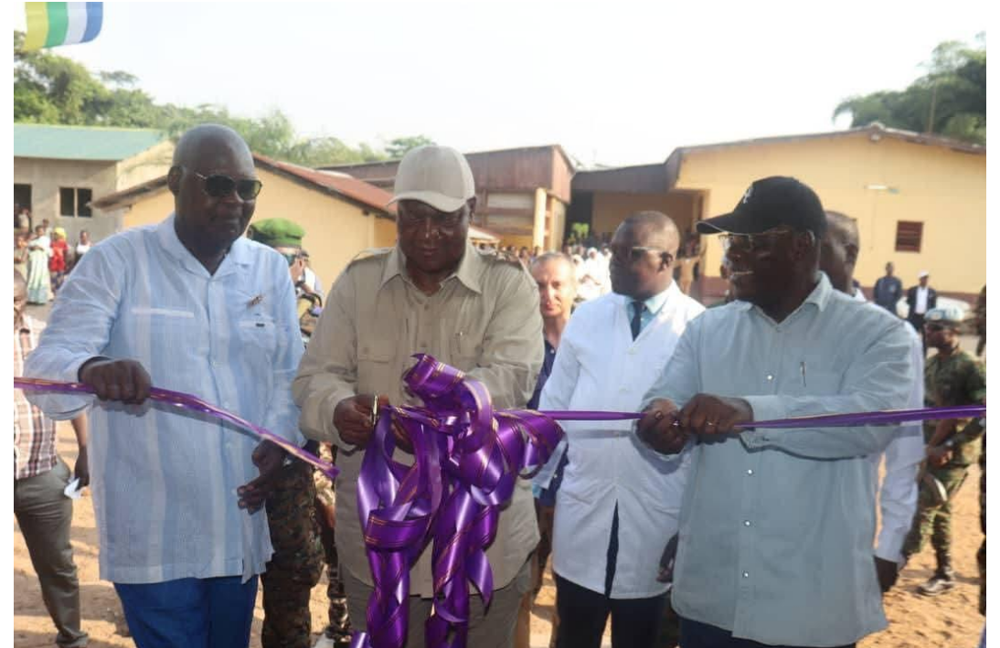
Bayanga Medical teams showcase the upgraded pediatric and neonatology services designed to improve care for mothers and children.