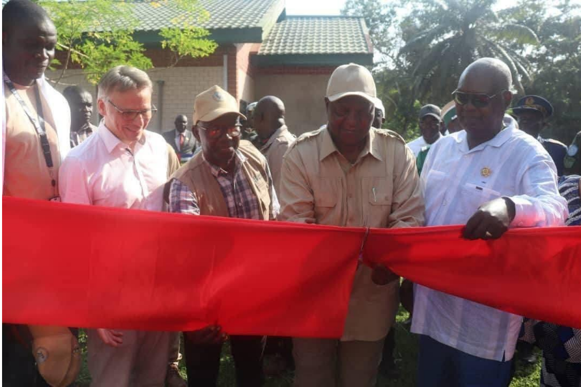
Partners from the Helmholtz Institute for One Health and the Institut Pasteur Bangui join APDS staff to open the new One Health Laboratory, reinforcing local research and disease-surveillance capacity.